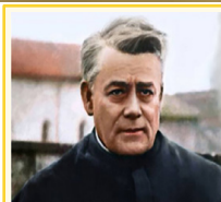
FR. Francis Jordan

Through religion everything is enveloped in a light that is at once clear and mystical. This is exactly what our human spirit needs.